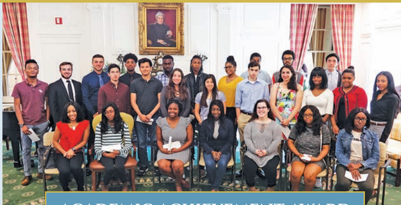
ACADEMIC ACHIEVEMENT AWARD