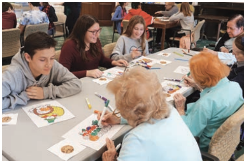
Intergenerational programs let high school students spend time with residents.