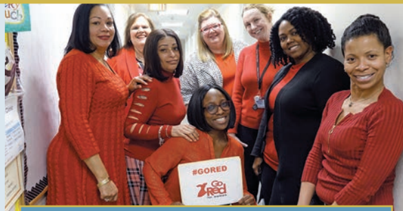
SUPPORTING HEART HEALTH

Residents and members of the community volunteer in many areas of The Osborn to enrich the experience for those who live here.